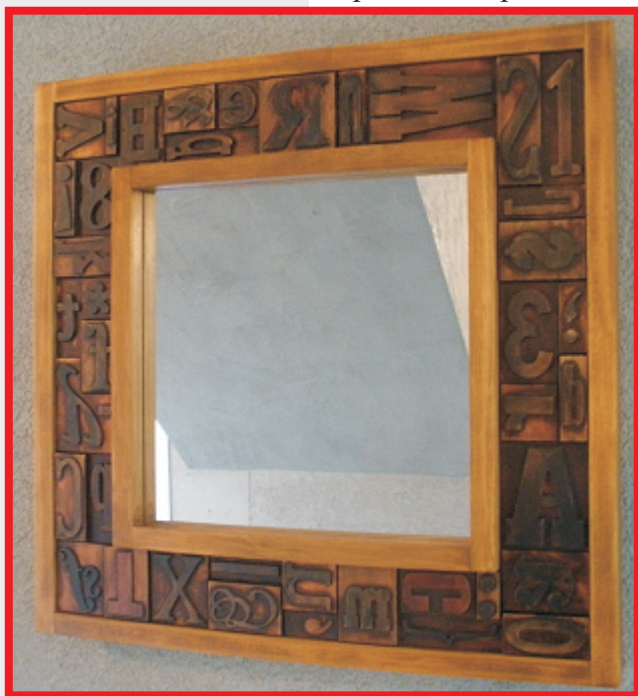
Dimensions are about 1.875" x 19" x 19"

find the end result is worth the extra effort. The toolpathing order is very important, as many of the toolpaths have start depths that depend upon a previous machining to a certain depth. Some paths are "paired" too, so please don't change the toolpath order when making modifications to suit your machine speed/feeds, material and bits.