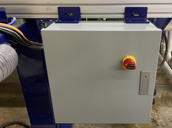
Figure 1: Standard Control Box mounted on 96x48 tool.