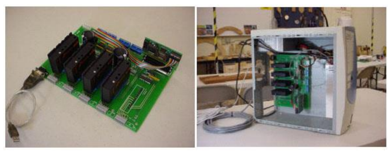
Driver color may vary – Current driver color is RED

Upgrade for an Existing PRT Standard Control System