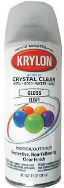
Krylon Clear Gloss Acrylic from WalMart™